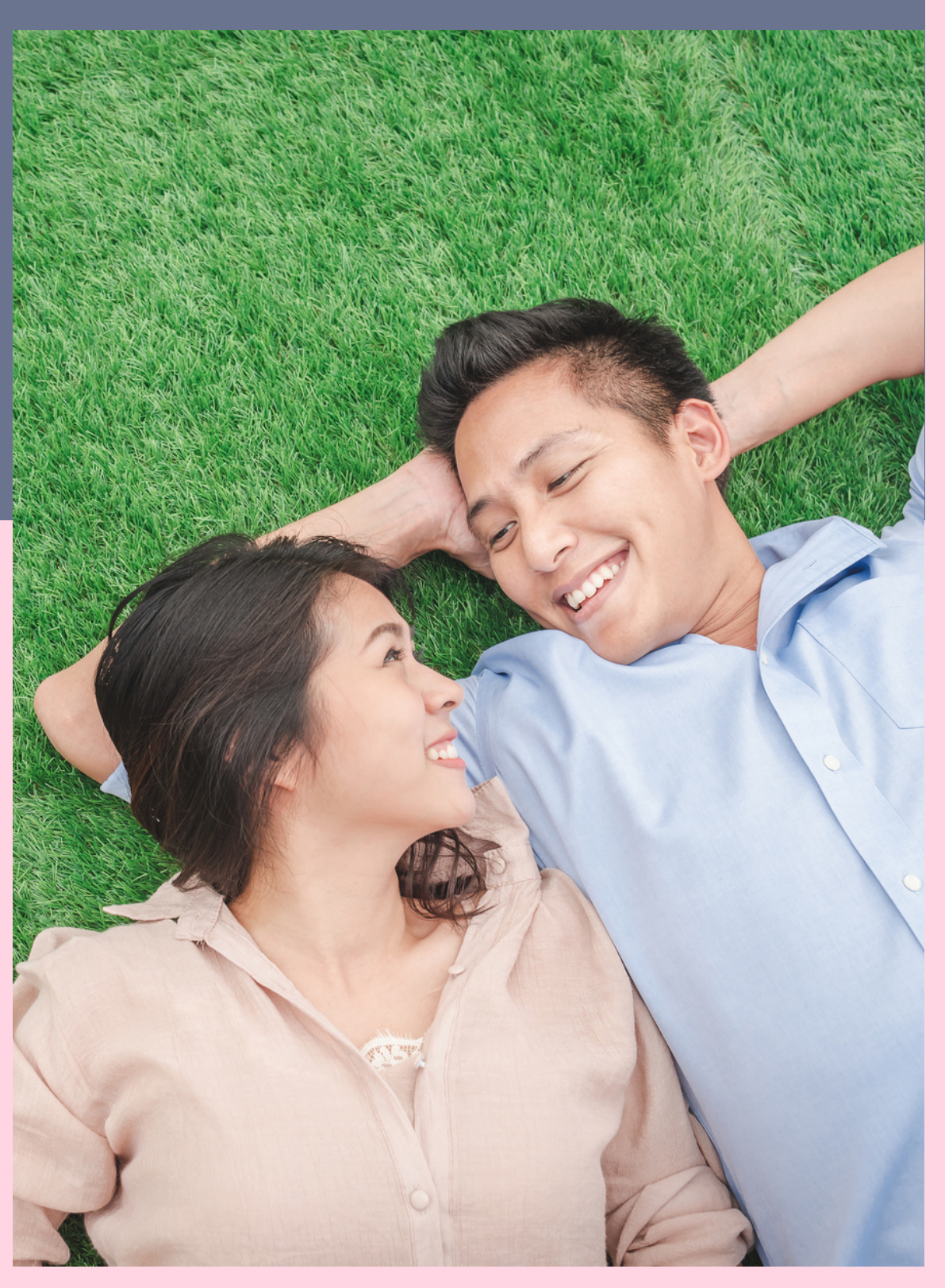
"You just gotta have faith that God will work things out. A wise boy taught me that a long time ago."